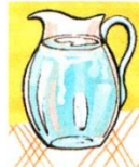
a jug of water